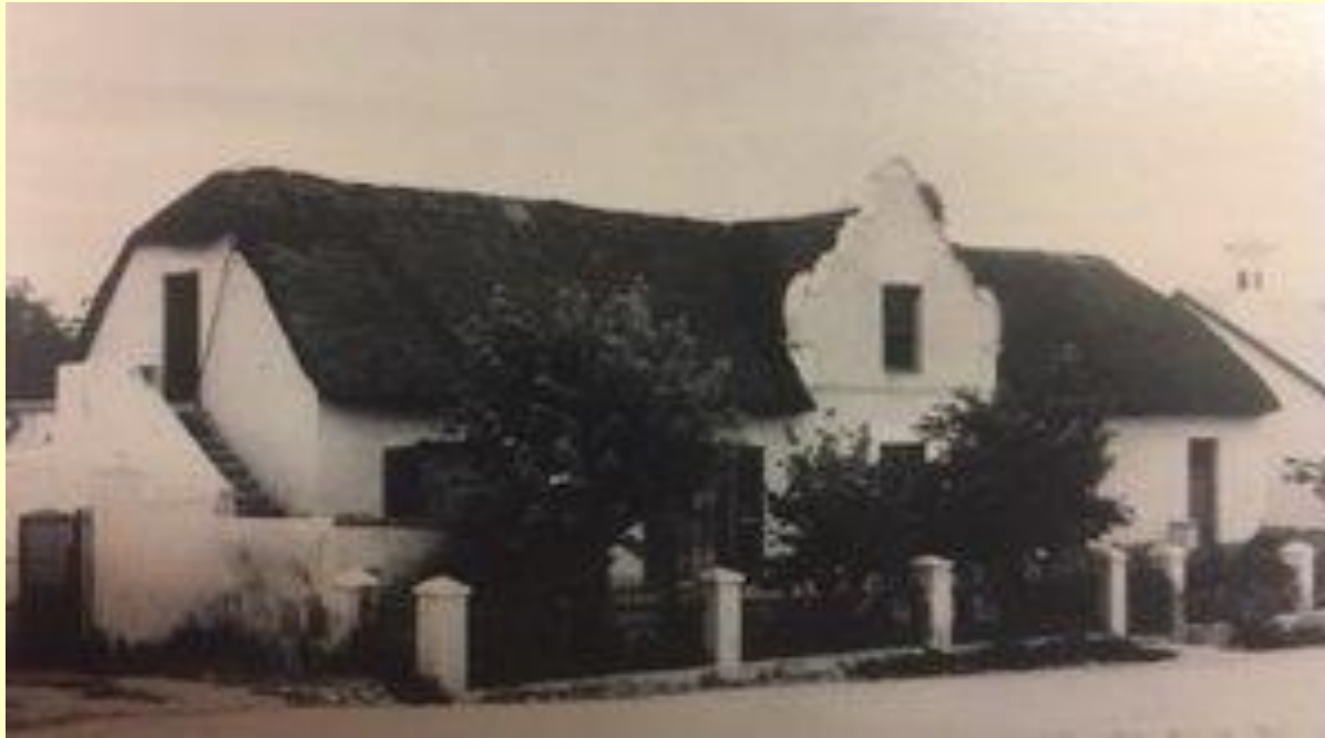
Our house in Malmesbury

and eggs and poultry – the hens or ducks in cages hanging from the axle under the cart and with cash in hand from the week's trading. Most of the enterprises of the Jewish community prospered and thrived.