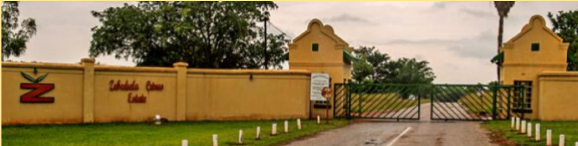
The Zebedelia citrus estate created by the Schlesinger family in the Northern Transvaal.

Were your parents or grand or great-grandparents or any family members involved with farming or agriculture in South Africa? There are so many amazing Jewish innovators in this under researched area of South African Jewish history.