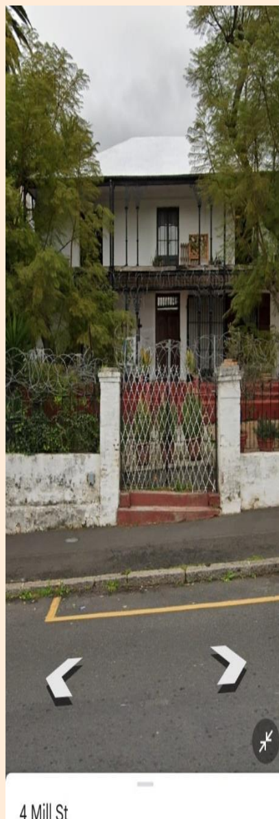
The Antonis Home -4 Mill Street, The Gardens, Cape Town.