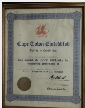
A Gold Diploma from the Cape Town Eisteddfod for the Cabaret Trio 1960

My mind regresses back to the Freda Fernandez School of Dance where I performed Cabaret Work- from Can-Can to Slaughter on Tenth Avenue , Frankie and